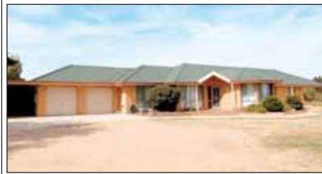
TABLE TOP Lifestyle living - 1.7Ha Farmlet

With easy access to the new freeway this excellent property is conveniently located. Perfectly aspected with 4 bedrooms and a study plus huge separate rumpus room there is room for the growing family inside and out. Impressive outdoor area and developed surrounds add appeal.